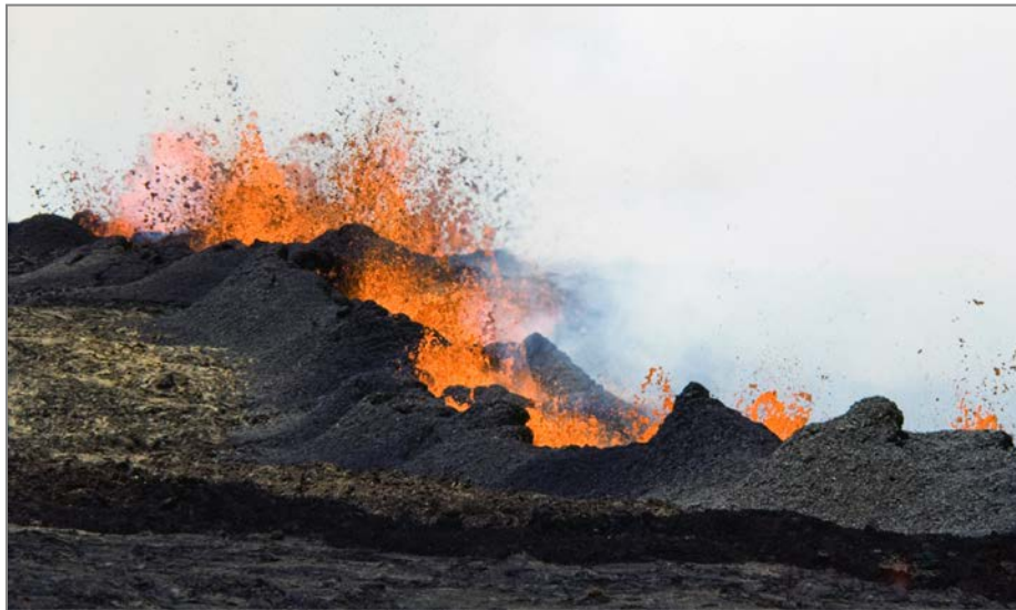
Erupting fissure on Mauna Loa's Northeast Rift Zone in March 1984.